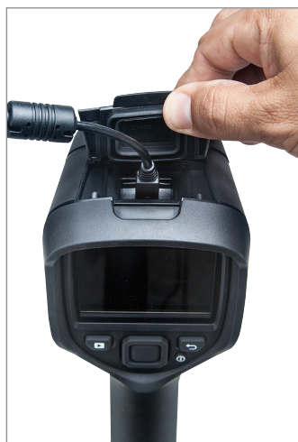
Download images fast via USB

Specifications are subject to change without notice. For the most up-to-date specifications, go to www.flir.com