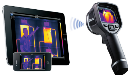
Wireless Connectivity to Smartphones, Tablets and more.

PORTLAND Corporate Headquarters FLIR Systems, Inc. 27700 SW Parkway Ave. Wilsonville, OR 97070 PH: +1 866.477.3687